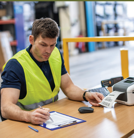
TD professional desktop label printers

Brother's range of TD professional thermal printers allows you to print high quality labels on demand. Printing labels up to 4 inches in width, using direct thermal and thermal transfer print technology, they fit the requirements of a large range of market applications.